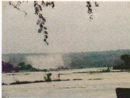
Mosi O Tunya "The Smoke that thunders." Victoria Falls - One of Livingstone's discoveries