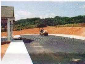
Finally a hard surface!