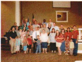
Missionary Training School 2010 Class

I was about to tell you how busy we have been and how many miles we have traveled, when I thought about David Livingstone, whose biography I have just finished reading again. He traveled 29,000 miles criss-crossing Africa through parched deserts, flooded rivers and through the lands of savage and unpredictable people. Much of that time he was without clean water (sometimes, no water) and sufficient food, and was plagued by Malaria, pneumonia, and other exotic diseases. Most of it was done on foot with a buffalo, donkey or boat ride occasionally. He kept cutting away his shoes to allow for the blisters. How wimpy we modern Christians are! So, I just decided to thank God for our little Chevy Malibu and for not making us "worthless workmen in a world full of work." (I also learned that Livingstone's home in Kolobeng, Botswana is only 30 miles from where Travis and Mimi live. I am looking forward to visiting it the next time we are in Africa.)